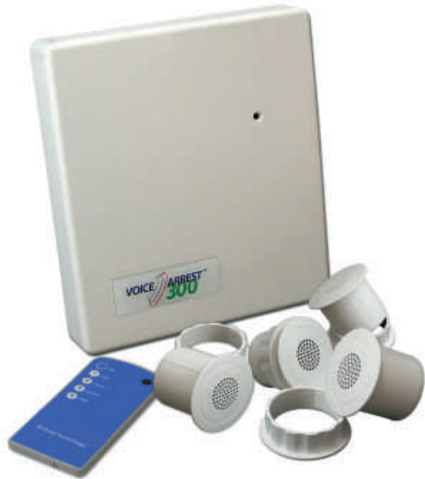
Controlled Assess, Ceiling Tile-Based System, Providing State-of-the-Art Direct-Field Speech Privacy Technology

At least one HIPAA issue is widely misinterpreted, so it is a potential source of unanticipated liability costs for healthcare providers and insurers. The issue has viable cost-effective solutions, but a lack of awareness has created a vacuum that needs to be addressed.